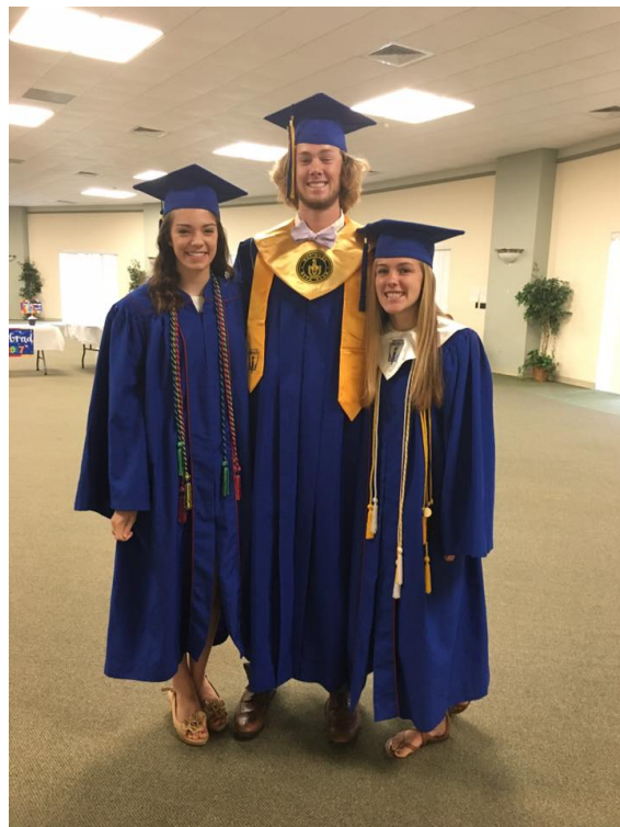
Three of our high school graduates.

Thank you to everyone who helped us celebrate all of our graduates on Sunday, May 21. We wish you all the best in the next step of your journey. Congratulations!